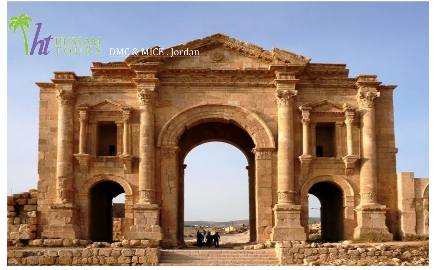
Jordan Special Roundtrip